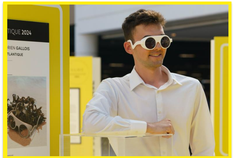
OPTICAL CONTEST 2024